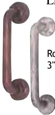
Rod Pulls 3", 3½" & 4"