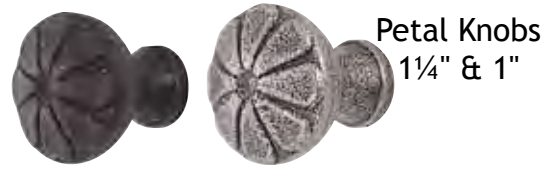
Petal Knobs 1¼" & 1"

Charming highlights for a rustic or provincial décor, pulls & knobs celebrate the blacksmith's art. Available in Rust, Flat Black & Satin Steel.