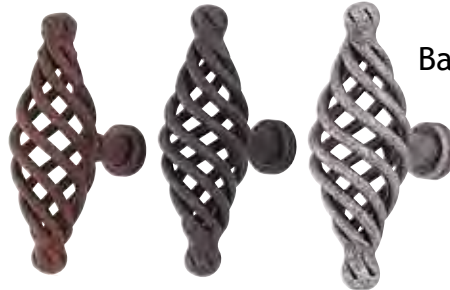
Bastogne Knobs 2¾" & 3¾"