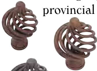
Flanders Knobs 1½" & 1¼"