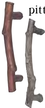
Twig Pulls 3", 3½" & 4"

Engagingly primitive, and perfect for a country home. Sandcast with a pitted surface & hand finished in 3 finishes. Silver Patina, Light Bronze & Dark Bronze.