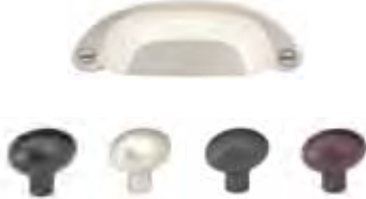
Egg Knob 1¼" & 1" Also available in Round Knobs